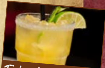
Featured Margarita $5