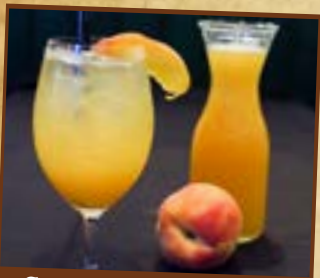
Sangria Carafe $9 Red or Peach