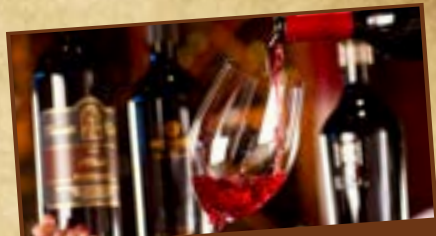
$1 OFF Wine by the Glass