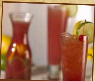
Sangria Carafe $9