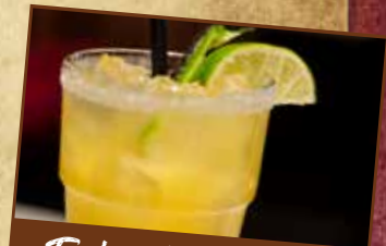
Featured Cocktail $5