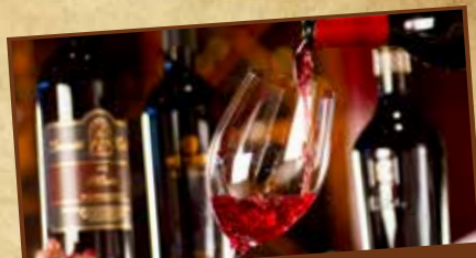
$1 OFF Wine by the Glass